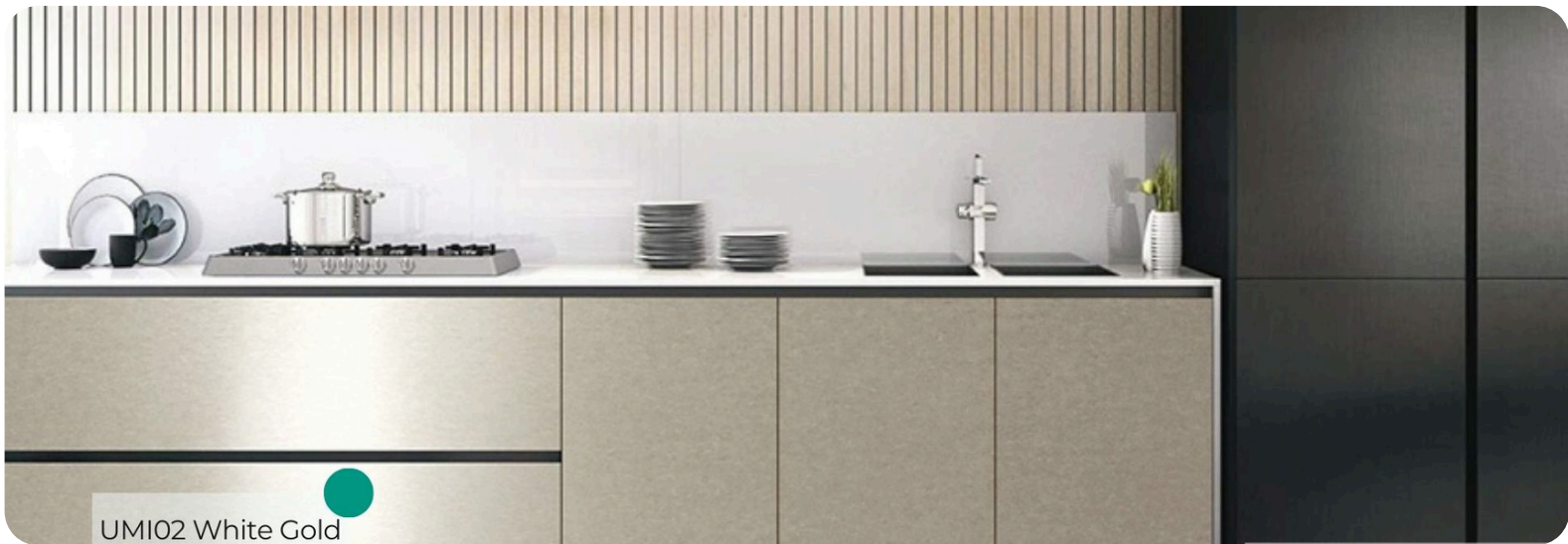
UMI02 White Gold