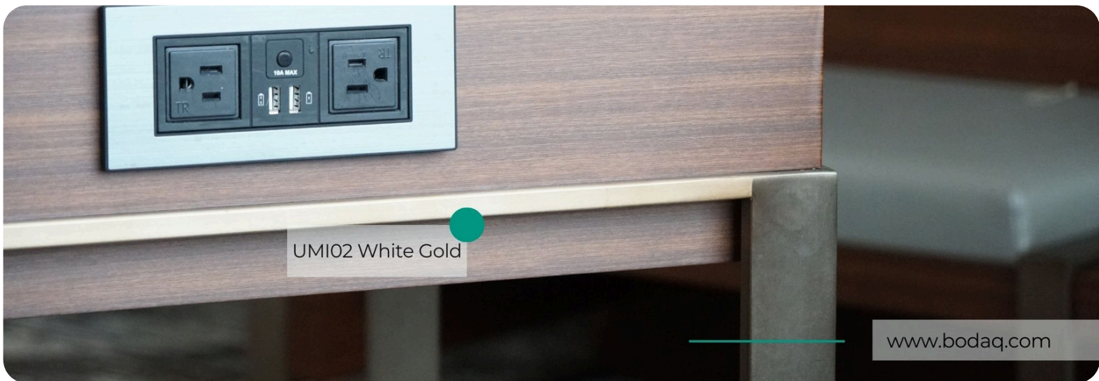
UMI02 White Gold