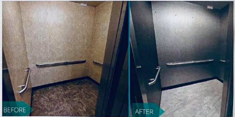
The film protects from scratches and other damage from everyday use.