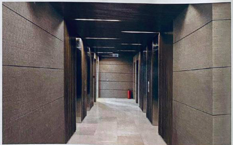
A film from the company’s “Fabric Collection” used in lobby refinishing