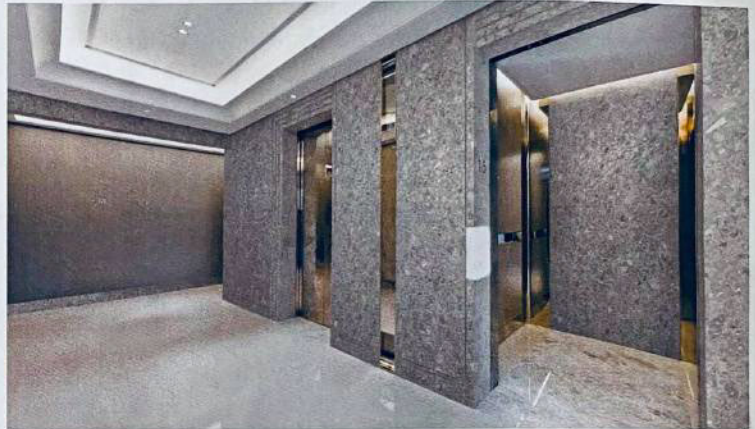
“Terrazzo Premium” Bodaq Interior Film used in lobby refinishing