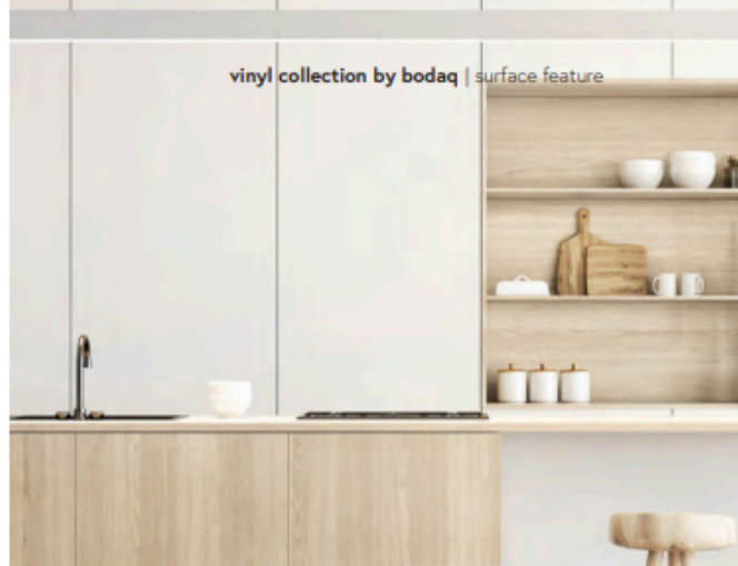
vinyl collection by bodaq | surface feature

B odaq interior vinyl film collections have more than 450 patterns of different textures: wood, metal, texture, leather, solid, stone, marble. All of them leave a satisfying tactile sensation in the same way as if you touch the original material. Here is a breakdown of our primary pattern collections and how they can work design miracles, such as tables in real leather, all-marble bathrooms, and more.